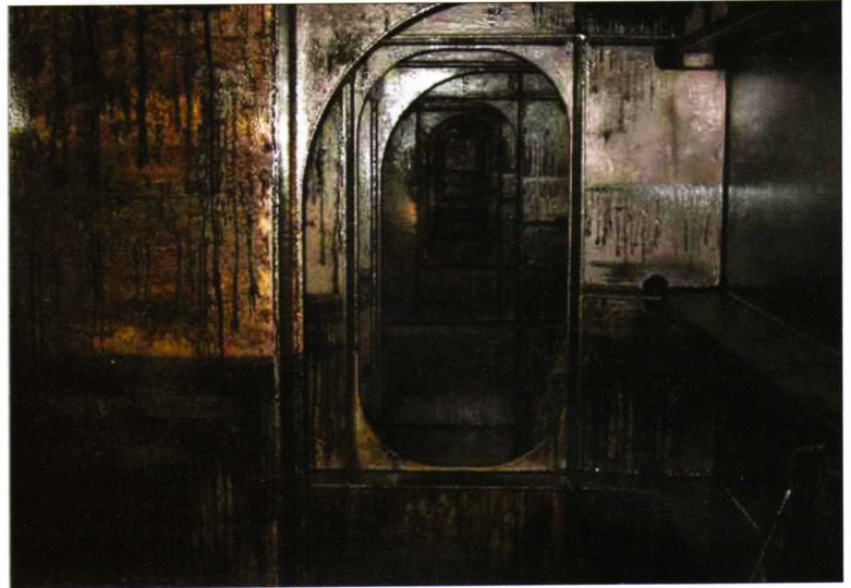
This photo gives some idea of what a contaminated tank looks like

After setting up the necessary equipment, the contaminated tank walls are treated with Cytoclean taking care to coat the adhering oil completely. After an hour the oil becomes dislodged and the process is completed by gently spraying the tank surfaces with any kind of water available at low pressure. The resulting oil/water mixture is then pumped into empty containers